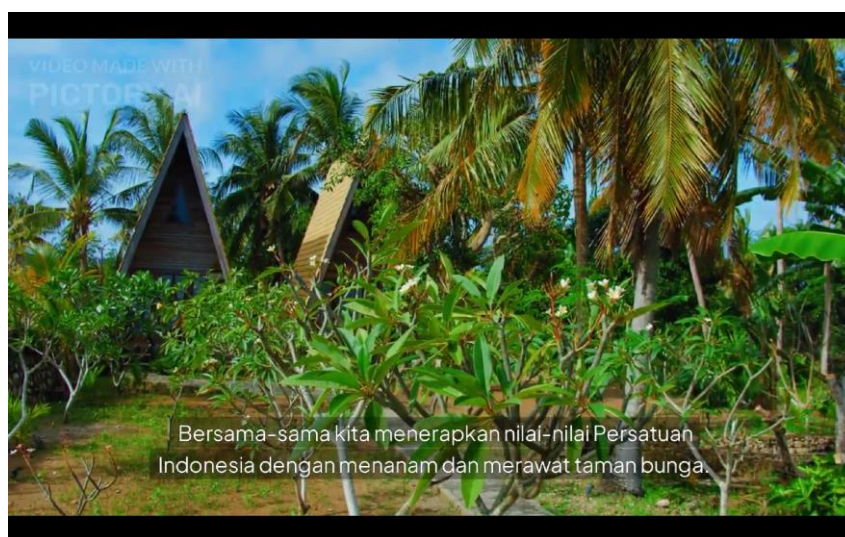
Picture 4. 2 Capture of Video of Student Creativity Theme of the 3rd Precept

Other creativity can be seen in the image capture from the video on the theme of Indonesian Unity, where students show cultural diversity and cooperation through joint activities, such as planting and caring for a flower garden. In the scene, the visual of a beautiful garden with collaborative narration shows how the value of unity is applied in everyday life. Students successfully illustrate that unity can be realized through simple yet meaningful activities, which are relevant to the values of Pancasila.