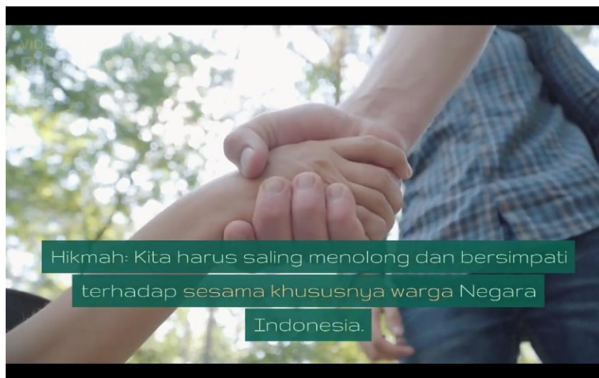
Figure 4.1 Image Capture from Video of Student Creativity Results on the 2nd Precept Theme

Videos produced by students through project-based learning using Pictory.AI showed significant creativity in depicting the practice of Pancasila values. One example is an image capture from a video showing the action of gotong royong through visual narration, where students illustrate cooperation in helping others. In one of the scenes, there is a visual handshake with text explaining the importance of helping and sympathizing with others, especially Indonesian citizens. This reflects the internalization of the value of Fair and Civilized Humanity visually and narratively.