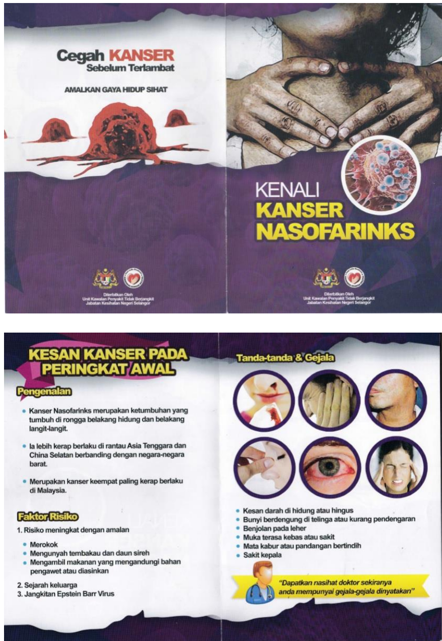
Figure 1. NPC pamphlet produced by the Ministry of Health, Malaysia

the bottom of Page 3, the public were cautioned to get their doctor's advice if they have any of these signs and symptoms. Page 4 extols the public to prevent cancer before it is too late and to practise a healthy lifestyle (" Cegah Kanser Sebelum Terlambat ", " Amalkan gaya hidup sihat "). The logo and name of the ministry is placed on the first and last pages of the NPC pamphlet to show the authoritativeness of the information in the pamphlet.