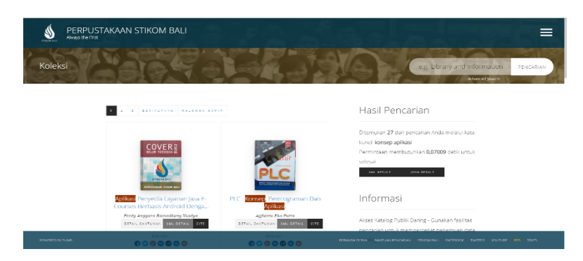
Figure 2.1 E-Library Of ITB STIKOM Bali